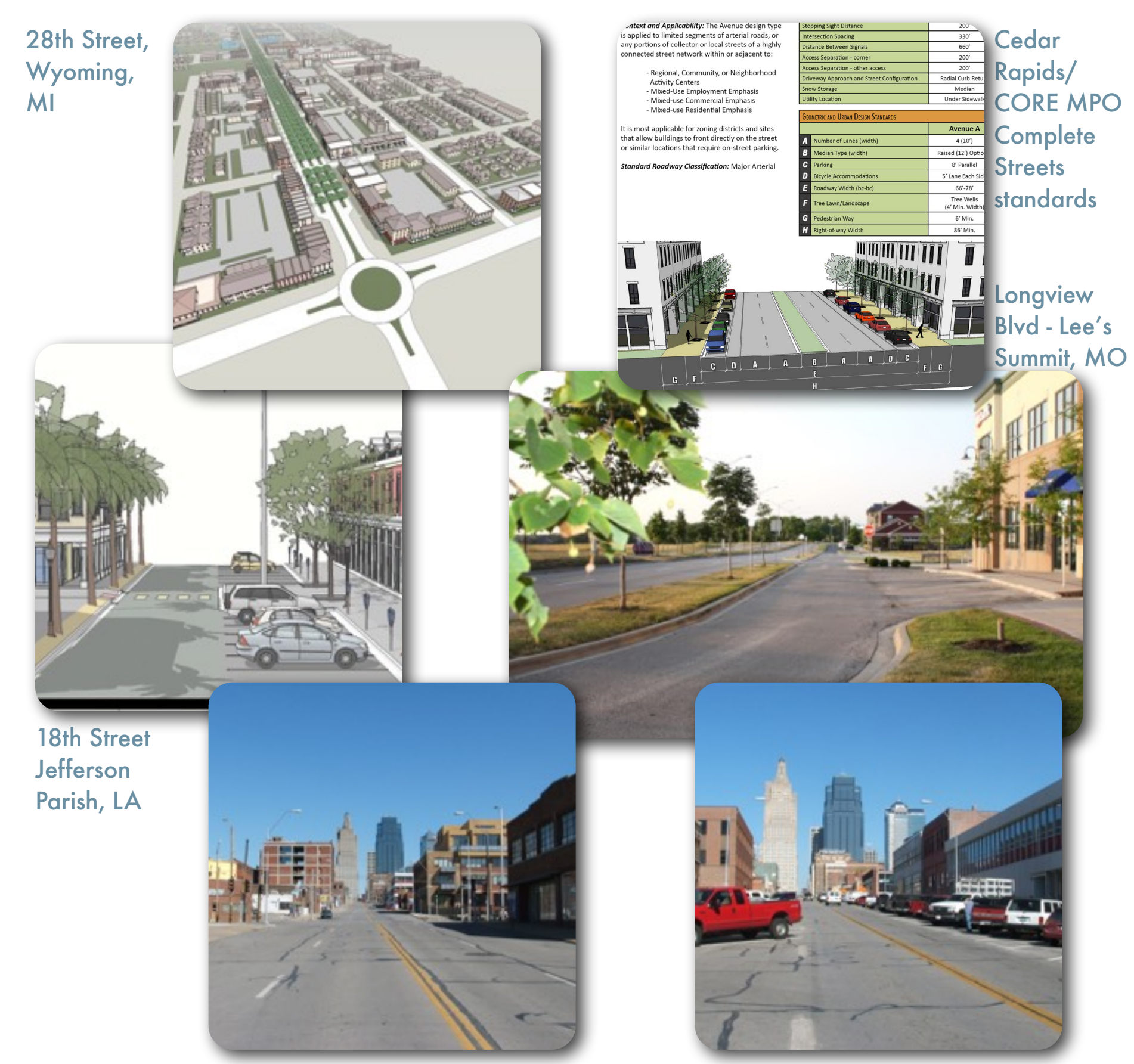
Baltimore Ave - KCMO Before